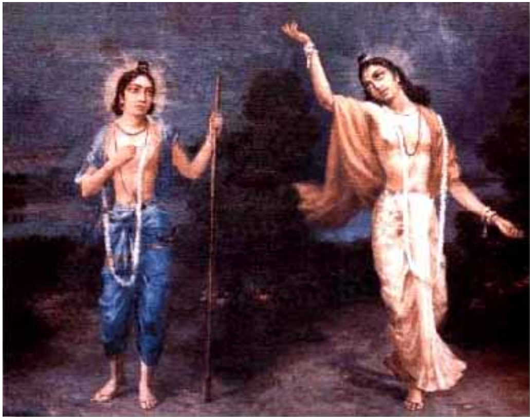
Sri Nityananda and Sriman Mahaprabhu

"Rupa Goswami Prabhupada says that Krsna's name, form, qualities, and eternal associates everything about Him - is not mundane, but purely spiritual. It cannot be perceived by our gross senses. Simply by vibrating the sound krsna, our tongues cannot produce Krsna, our noses cannot catch the transcendental fragrance of His body, our eyes cannot have a vision of His beautiful figure which is supramental. This is true not only for our physical senses, but for the mind also. Our minds cannot conceive of Krsna. He is transcendental and supramental. His existence transcends all the knowledge in our possession."