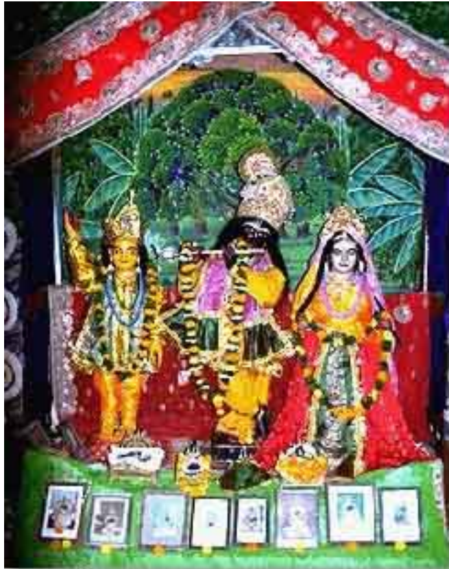
Sri Sri Gauranga Gandharva Govinda-sundara Deities of the Sri Chaitanya Saraswat Math